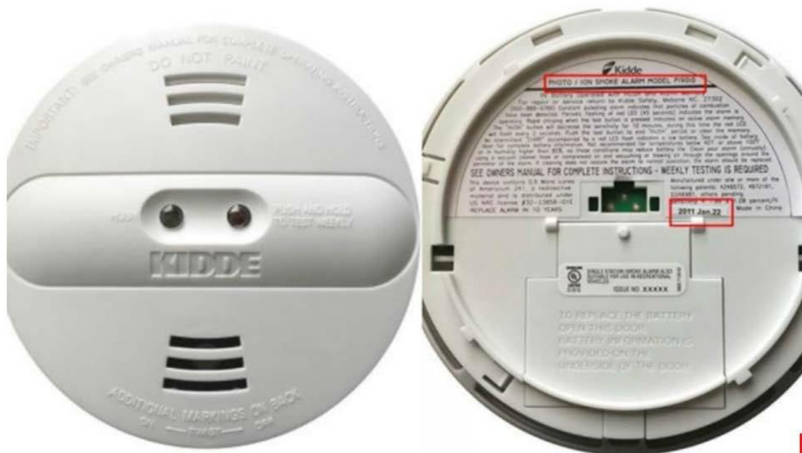
Kidde dual-sensor (photoelectric and ionization) smoke alarms | Consumer Product Safety Commission