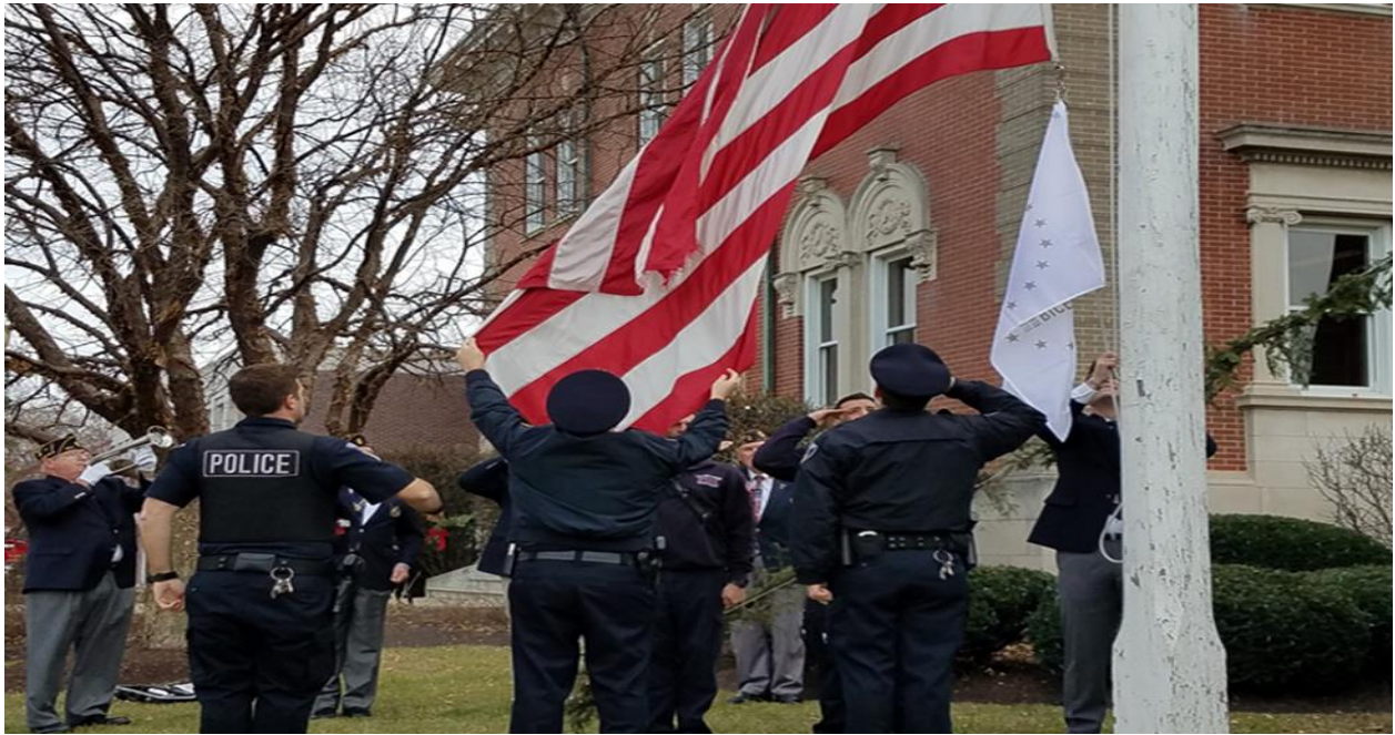
On Monday December 4 th members of the American Legion Post 1941 and La Grange police and fire department members prepare to raise the State of Illinois Bi-Centennial flag in front of the La Grange Village Hall.